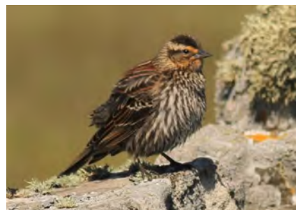
Red-winged Blackbird (North Ronaldsay, Orkney, April 2017) was one of only two species admitted to the British List in 2018.