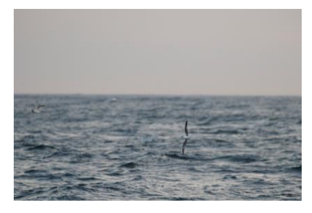
Zino's Petrel Pterodroma madeira , admitted to the British List in 2022.

The Committee maintains close links with the British Birds Rarities Committee (BBRC). The BOURC Secretary continues to work closely with BBRC's Secretariat and other European committees, and close links are maintained with Association of European Records Committees (AERC).