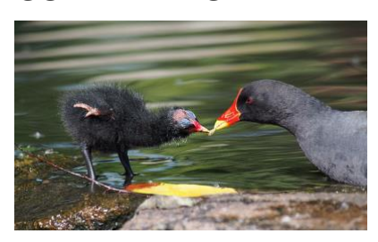
AVIAN REPRODUCTION 12-14 April 2022 | Zoom & Twitter #BOU2022

Image: Moorhen feeding chick | Francis C. Franklin CC BY SA 4.0 Wikimedia Commons